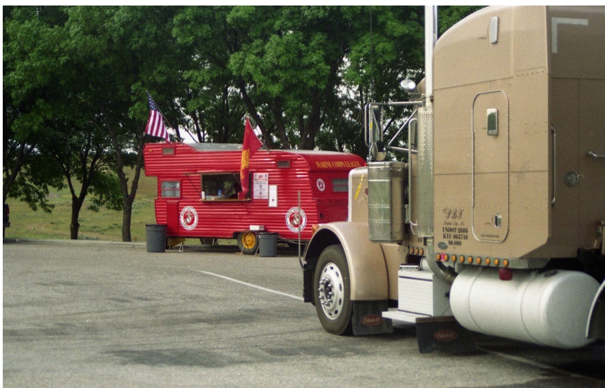
Coffee Wagon vs Semi.

The Coffee wagon made its maiden voyage in May of 2003 at Black Creek rest-stop on I84 and is once again on station at the remodeled rest-stop on Interstate 84 west-bound. After its first season we found that it was a complete success and provided some fun catching styrofoam cups when the wind would blast through the natural wind-tunnel in the area. And more than once we came close to being clob-